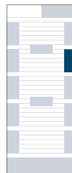
UPPER LATERAL 120 X 190 PIXELS 200 KB TOP U$S 107 + VAT