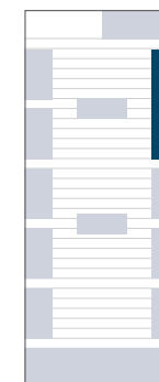
DOUBLE UPPER 120 X 380 PIXELS 200 KB TOP U$S 214 + VAT