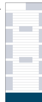
FOOTER 740 X 90 PIXELS 200 KB TOP U$S 138 + VAT