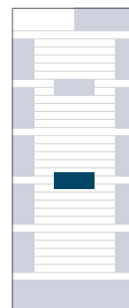
LOWER CROSS SECTIONAL 345 X 65 PIXELS 200 KB TOP U$S 81 + VAT