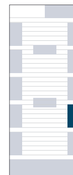
LOWER LATERAL 120 X 190 PIXELS 200 KB TOP U$S 69 + VAT